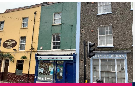
Five Storey Mixed-Use Investment

4 Merchants Road, Hotwells, Bristol BS8 4PZ