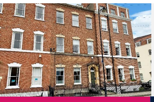
8 Brunswick Square, Bristol BS2 8PE