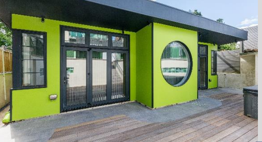
Guide Price: £235,000+