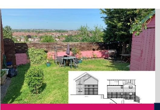
Guide Price: £100,000+

Land adjoining 46 The Crest, Brislington, Bristol BS4 3JB