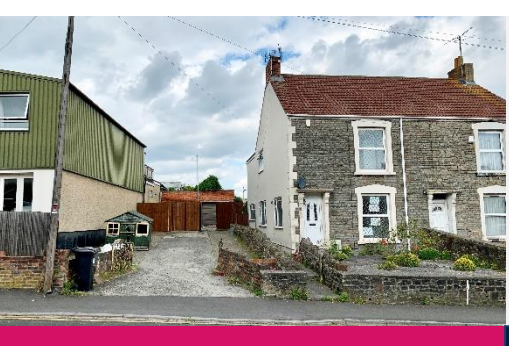
Guide Price: £200,000-£225,000

65 Hill Street, Kingswood, Bristol BS15 4HA